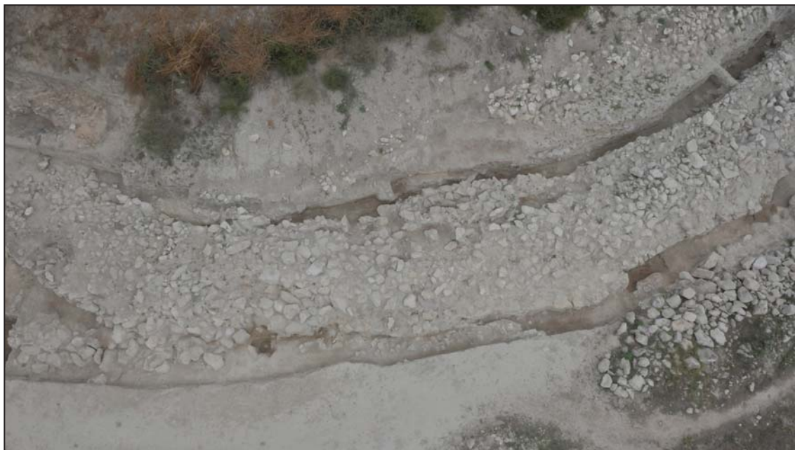
Fig. 3. Provadia-Solnitsata. Fortified stone wall 2 in the south-eastern and south-western section (the beginning of the Late Chalcolithic, circa 4500 BC). A view from above.

Рис. 3. Провадия-Солница. Каменная стена №2 на юго-восточном и юго-западном участке (начало позднего халколита, около 4500 BC). Вид сверху.