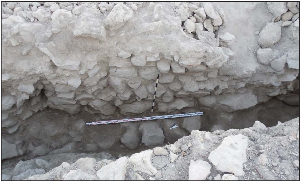
Fig. 4. Provadia-Solnitsata. Inner face of the fortified stone wall 2 in the south-eastern section (the beginning of the Late Chalcolithic, circa 4500 BC). Preserved height approx. 1.50 m.

Рис. 4. Провадия-Солница. Внутренняя сторона каменной стены № 2 на юго-восточном участке (начало позднего халколита, около 4500 BC). Сохранившаяся высота — около 1,50 м.