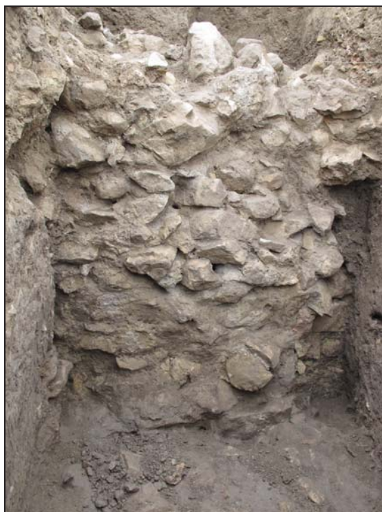
Fig. 1. Provadia-Solnitsata. Outer face of the fortified stone wall 2 in the north-western section (the beginning of the Late Chalcolithic, circa 4500 BC). Preserved height approx. 2.60 m.

Рис. 1. Провадия-Солница. Внешняя сторона каменной стены № 2 на северо-западном участке (начало позднего халколита, около 4500 BC). Сохранившаяся высота — около 2,60 м.